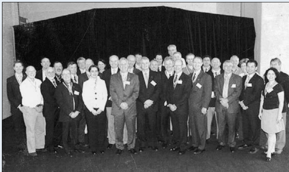
Perth Congress Inductees