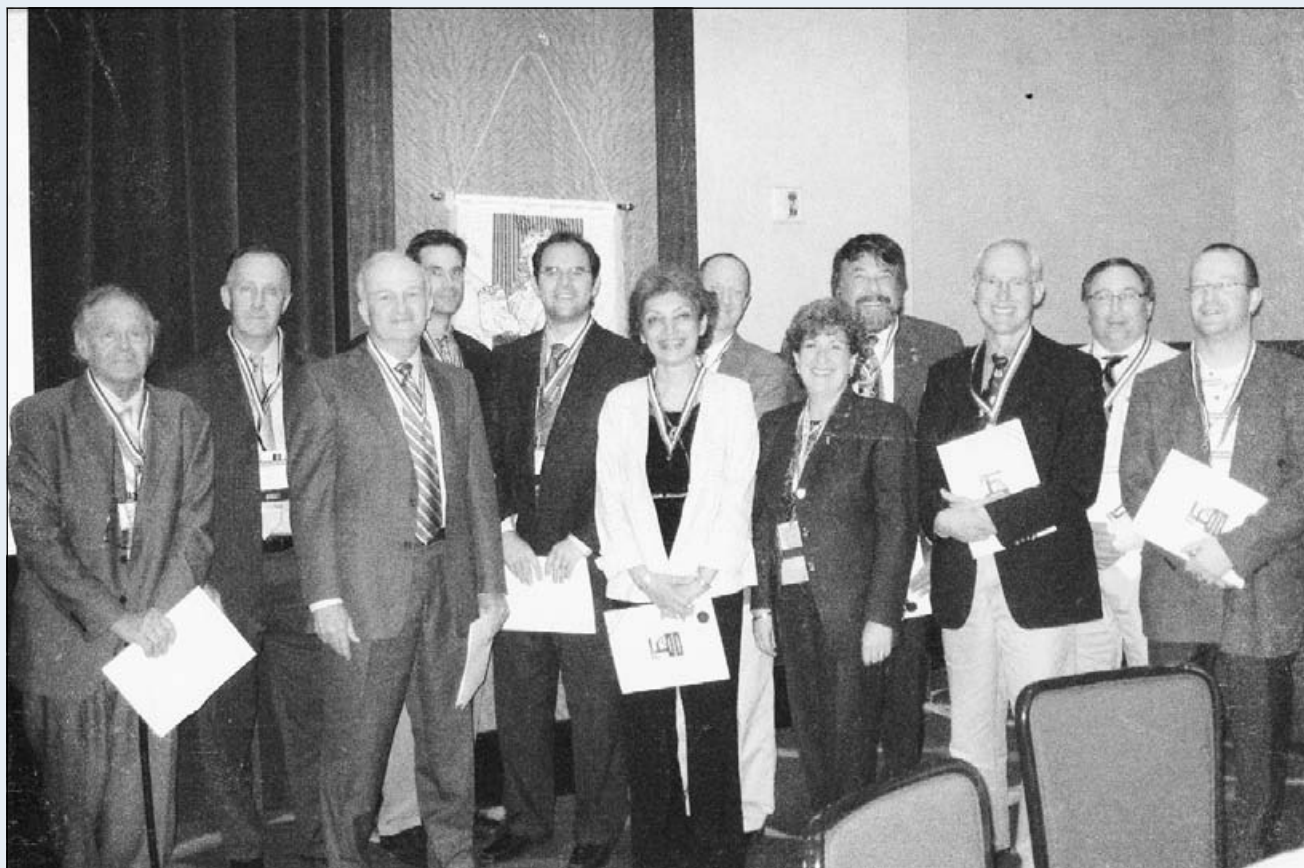
New Fellows Induction Ceremony