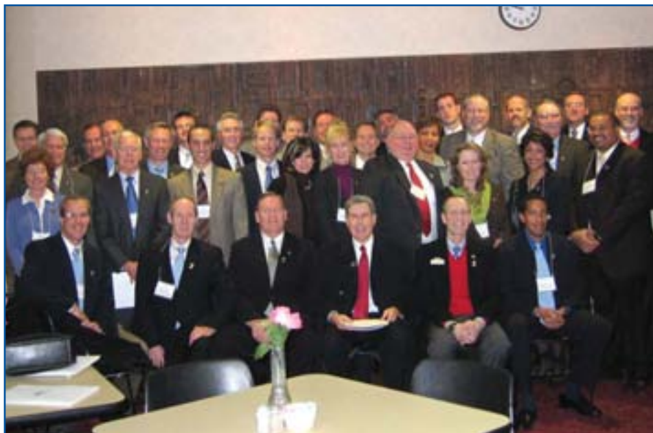
PFA Fellows gather at the 2007 Leadership Conference and Convocation.