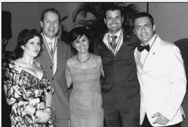
New Fellows and their wives