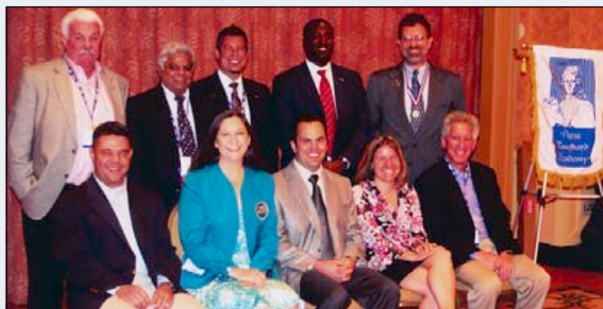
New Florida Fellows