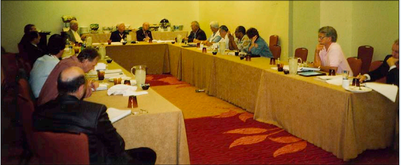
Annual Academy Board Meeting commences