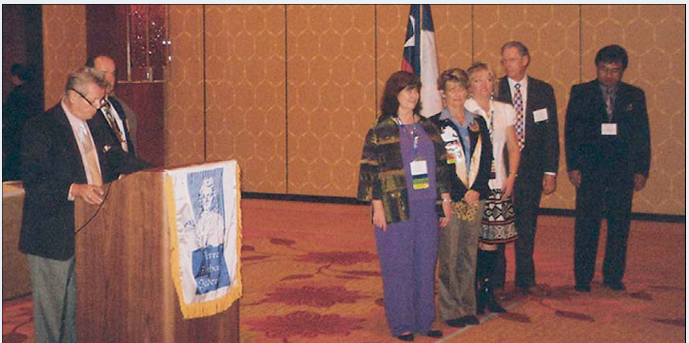
Induction of new Fellows