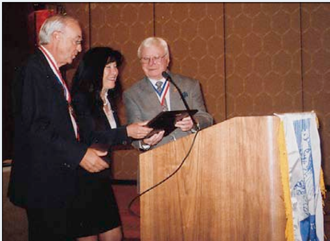
A Barnabo y Cia representative accepting the Dental Trade & Industry Award