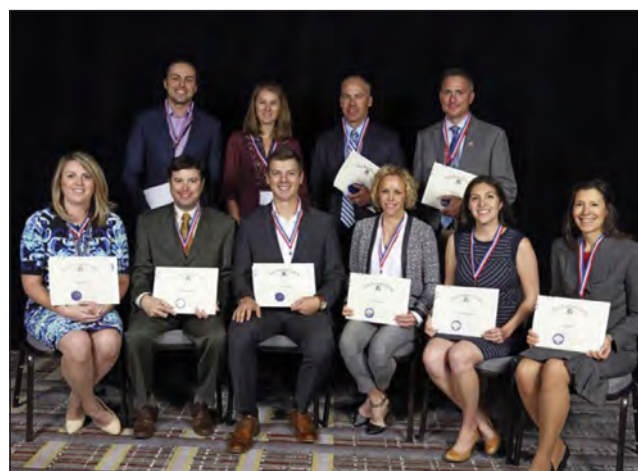
New Fellows from Colorado.