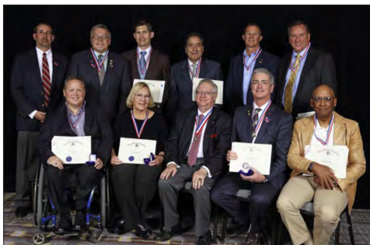
New Fellows from Kansas.